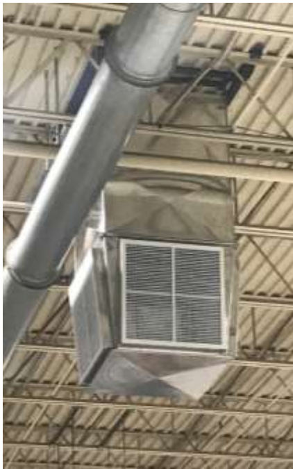
Cool air exhaust