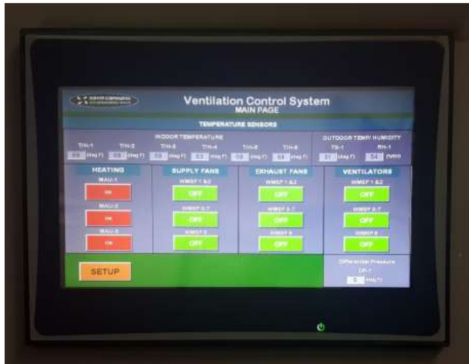
CoolStream Control Panel