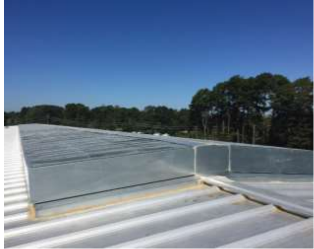
Dual/Double Mounted Thermoflow