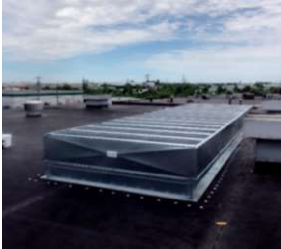
Flat Roof Mounted Thermoflow