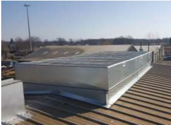
Peak Mounted Thermoflow