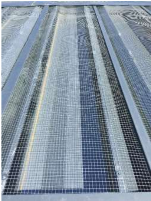
Thermoflow ® Cell