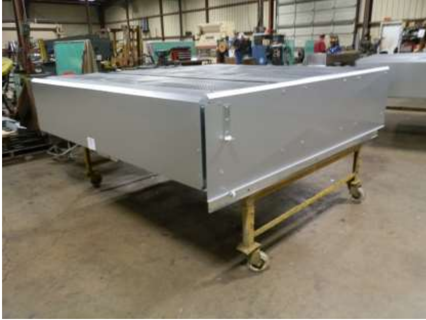
Thermoflow ® Module